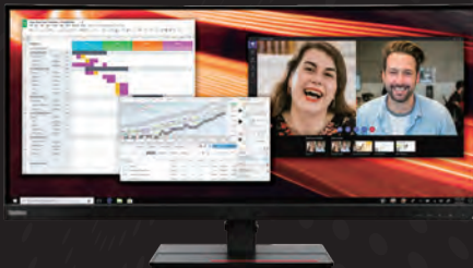
An eye – and ear – for detail

The P34w-20 kicks your work up a notch with outstanding visuals to show accurate colors from any angle. With WQHD 3440 x 1440 resolution, the monitor helps you capture even the smallest details while seeing true-to-life color with a 99% sRGB color calibration Delta E<2. Designed to impress, the 2 x 3W built-in speakers offer immersive audio that is true to your ears. The P34w-20 is also created with your health and comfort in mind, with eye-care and Natural Low Blue Light technology to reduce harmful high energy blue light emissions. Adjust the monitor height up to 150 mm to suit your ideal working style or position. Meanwhile, Lenovo ThinkColour 2 software allows you to easily and quickly adjust your screen settings with a simple click to enhance your work efficiency and optimize your monitor's extensive capabilities. Lenovo patented features, such as LAN on ThinkColour, show the network status from the screen to facilitate a more seamless workflow.