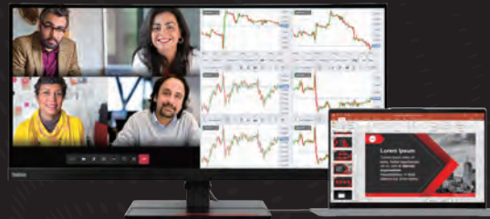
Master the art of multi-tasking

The P34w-20 kicks your work up a notch with outstanding visuals to show accurate colors from any angle. With WQHD 3440 x 1440 resolution, the monitor helps you capture even the smallest details while seeing true-to-life color with a 99% sRGB color calibration Delta E<2. Designed to impress, the 2 x 3W built-in speakers offer immersive audio that is true to your ears. The P34w-20 is also created with your health and comfort in mind, with eye-care and Natural Low Blue Light technology to reduce harmful high energy blue light emissions. Adjust the monitor height up to 150 mm to suit your ideal working style or position. Meanwhile, Lenovo ThinkColour 2 software allows you to easily and quickly adjust your screen settings with a simple click to enhance your work efficiency and optimize your monitor's extensive capabilities. Lenovo patented features, such as LAN on ThinkColour, show the network status from the screen to facilitate a more seamless workflow.